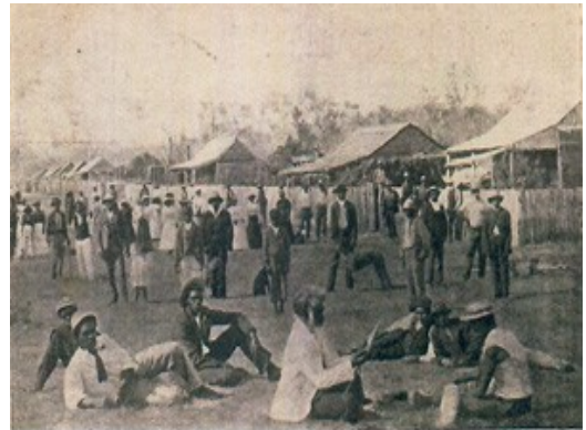
The Deebling Creek mission, Queensland, was founded by the Aboriginal Protection Society of Ipswich. Work started on the establishment of an Aboriginal mission at Deebling Creek around 1887.

"This is the parallel situation for migrants. As a constitutional practice for newly arrived immigrants, the Commonwealth officials issue them with temporary entry permits only. At the end of that period the Commonwealth then either asks them to leave the country, or offers to extend the permit for a further period, so as to ensure that they do not become absorbed into the Australian Community. When the Australian Government intends to offer the