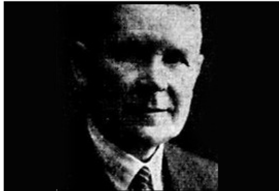
Auber Octavius Neville , Chief Protector of Aborigines, Western Australia (1915-1940) He wrote the book 'Australia's Coloured Minority' published in 1947 and which set out his long standing belief in the need to breed out the coloured population.

"The policy that was agreed upon at this 1937 National Conference was that a policy of assimilation could have the same effect, that is, remove the children from their families, educate and acculturate them into a single Australian community where everyone shall be influenced by the same beliefs, have the same customs as everyone else, by having the Aborigines 'absorbed' into the main stream community of the Australian State. Moreover, marrying the Aboriginal 'half-castes' into the lower class white Australia would see the disappearance of colour. Absorption into the white community will have been completed.