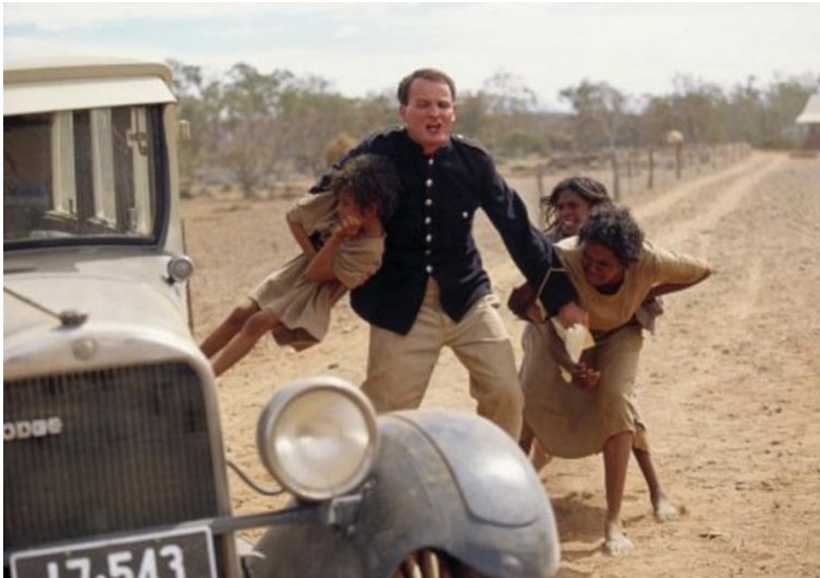
Scene from Rabbit Proof Fence